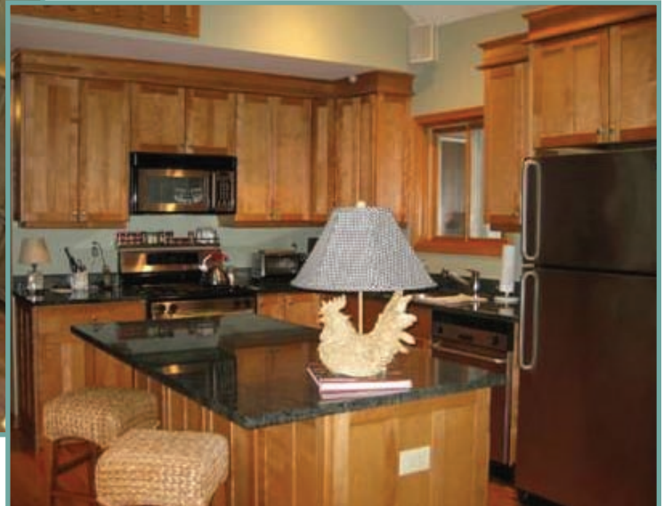
• Completely equipped kitchen with granite counters