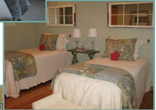
• Second guest room, twin beds