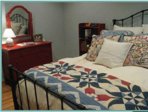
• First floor guest room, queen