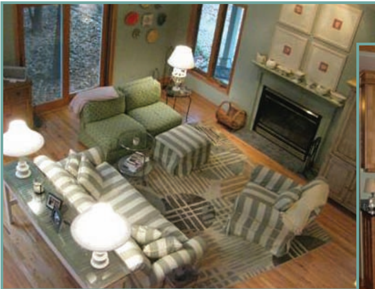
• Living room, fireplace, floor to ceiling windows three sides