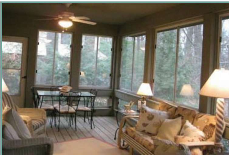
• Three season screen/window porch