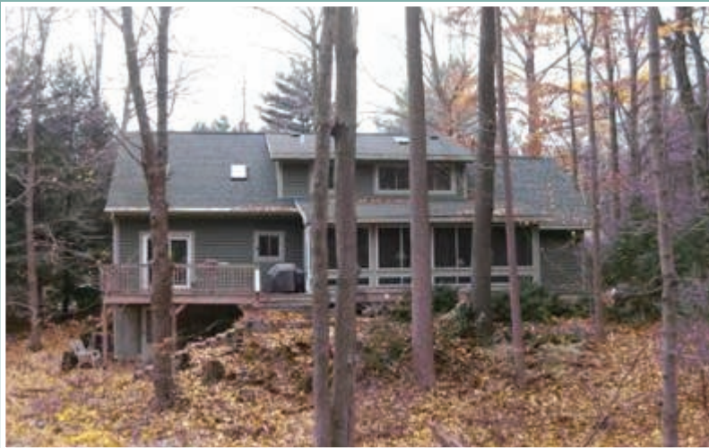
• Back of Dunes House: wooded lot, small stream, outside deck, three season porch

Highlights: 1 + acres of woods and wildlife; natural and secluded; a plank bridge over the stream; path to duck pond.