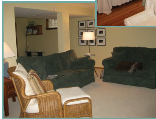
• Lower level game room with entertainment center and sofa bed, plus children's bedroom, twin beds