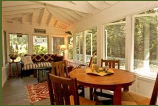
Three Season Porch