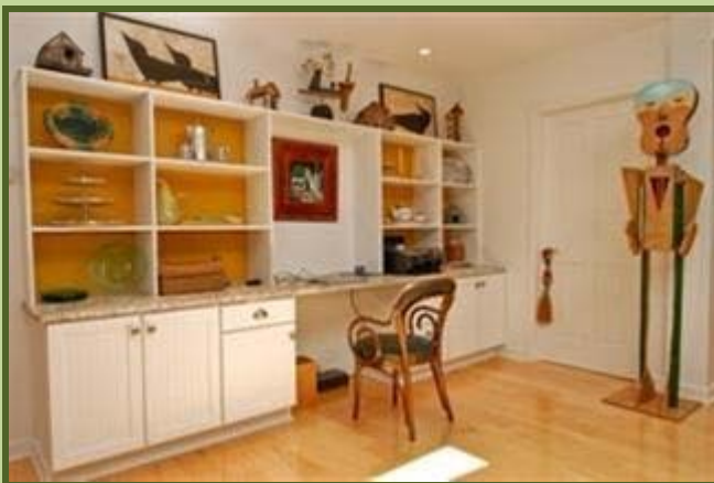
Office area across from kitchen