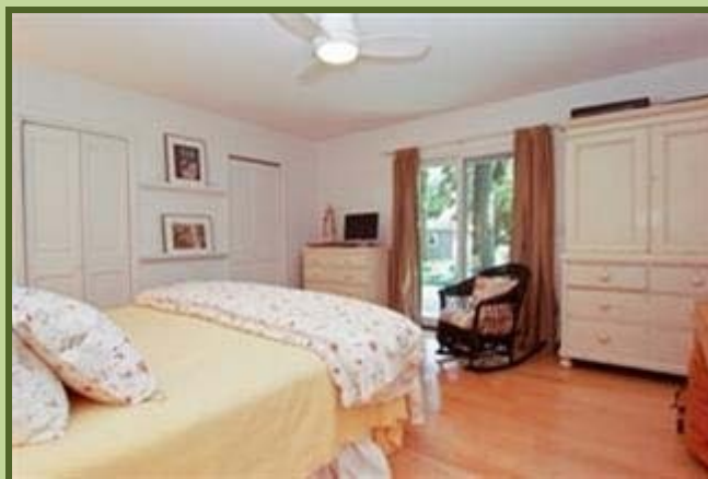
Master Bedroom Above