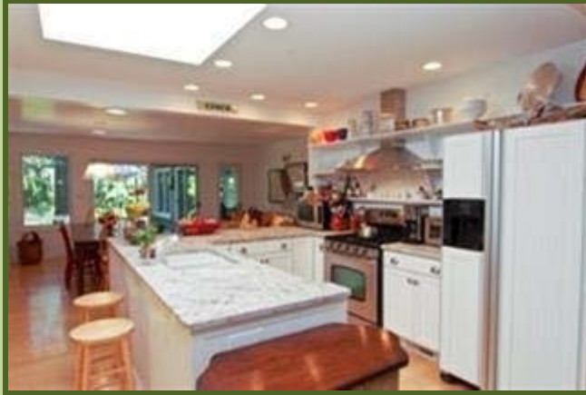
Gourmet kitchen lit by skylights. Dining area behind and sliding doors to the back door