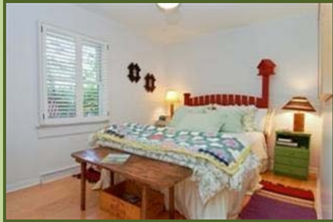
One of the two Guest Bedrooms