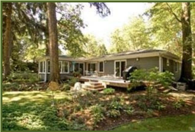
Cottage in a Garden from the back gardens.